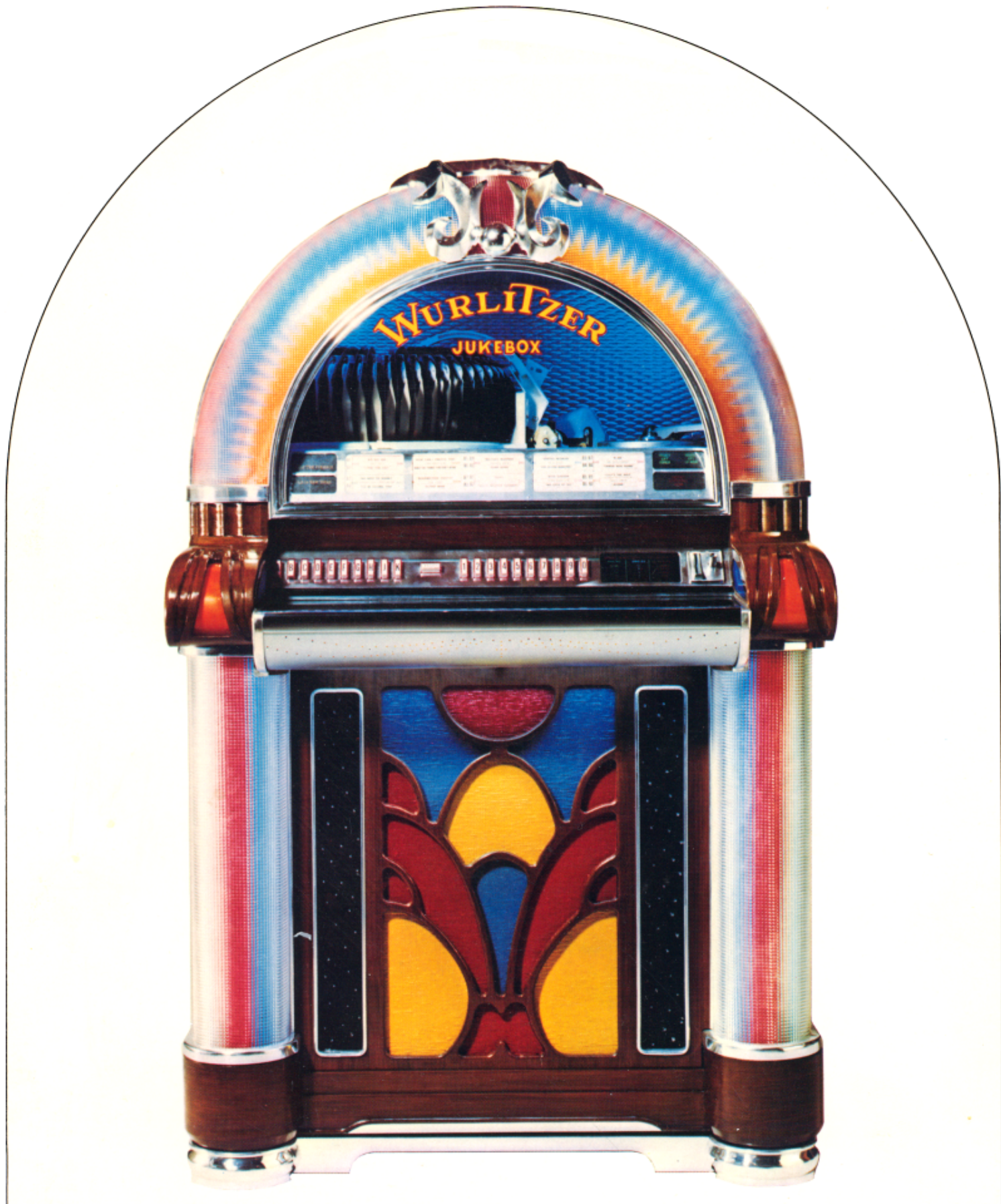
THE WURLITZER JUKEBOX